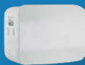
Z-Wave Plug In Dimmer - dual outlet $33