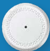
Glassbreak Detector $52