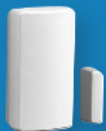
Door/Window Contact $14