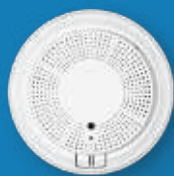
Combination Smoke, Heat & Carbon Monoxide Detector $124