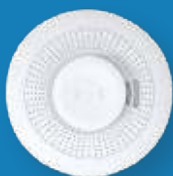
Smoke Detector $57