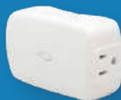
Z-Wave Plug In Switch - dual outlet $32