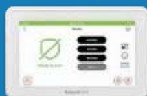
Wireless Touchscreen Secondary Keypad $150