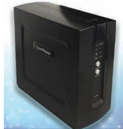
This is the type of battery backup installed at your residence. Actual backup unit model may vary.

Blue Stream Fiber can install, maintain and replace your battery when needed for a modest monthly maintenance fee or you may purchase, install and maintain your own battery backup unit. For more information, go to www.bluestreamfiber.com/battery-backup .