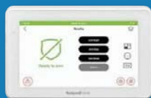
Wireless Touchscreen Secondary Keypad $150