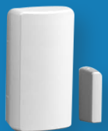
Door/Window Contact $14