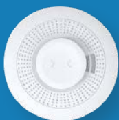
Smoke Detector $57