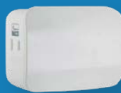
Z-Wave Plug In Dimmer - dual outlet $33