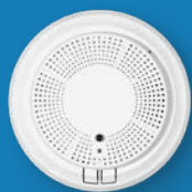
Combination Smoke, Heat & Carbon Monoxide Detector $124