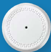
Glassbreak Detector $52