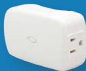
Z-Wave Plug In Switch - dual outlet $32